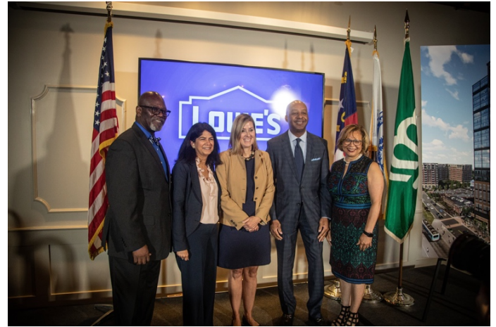
July 2019 Lowe's Home Improvement announcement for a Global Technology Hub bringing 1600 new jobs to Charlotte.