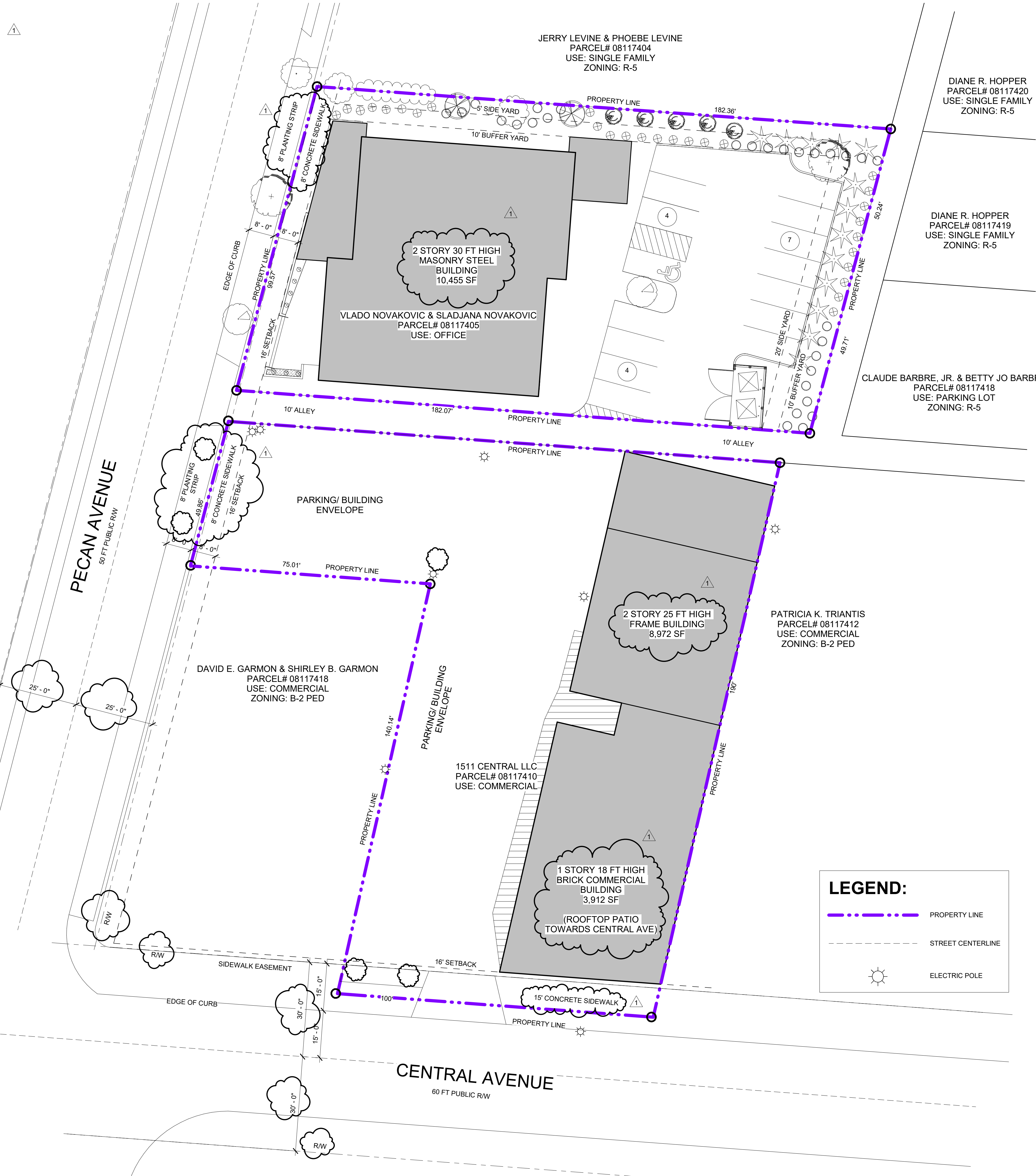
1 REZONING PLAN 1/16" = 1'-0"