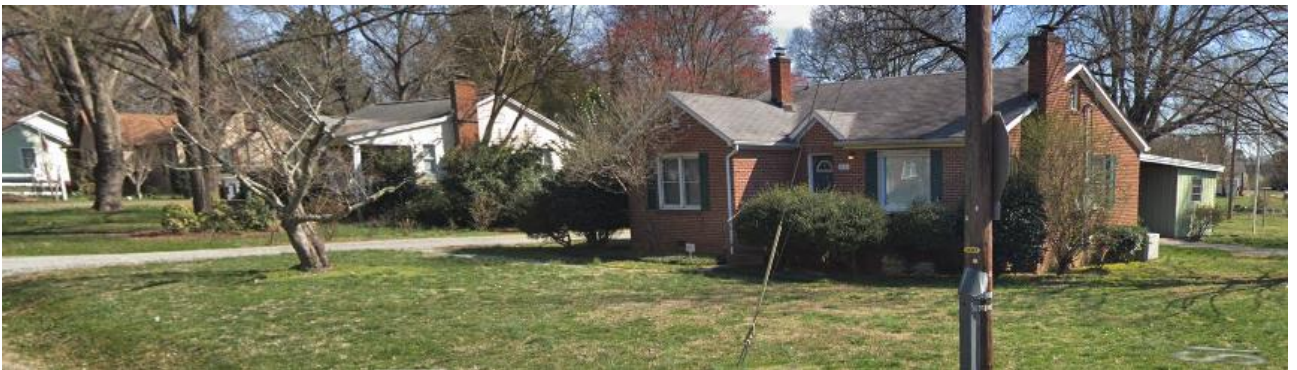
The properties to the south across Old Plank Road are developed with single family homes.