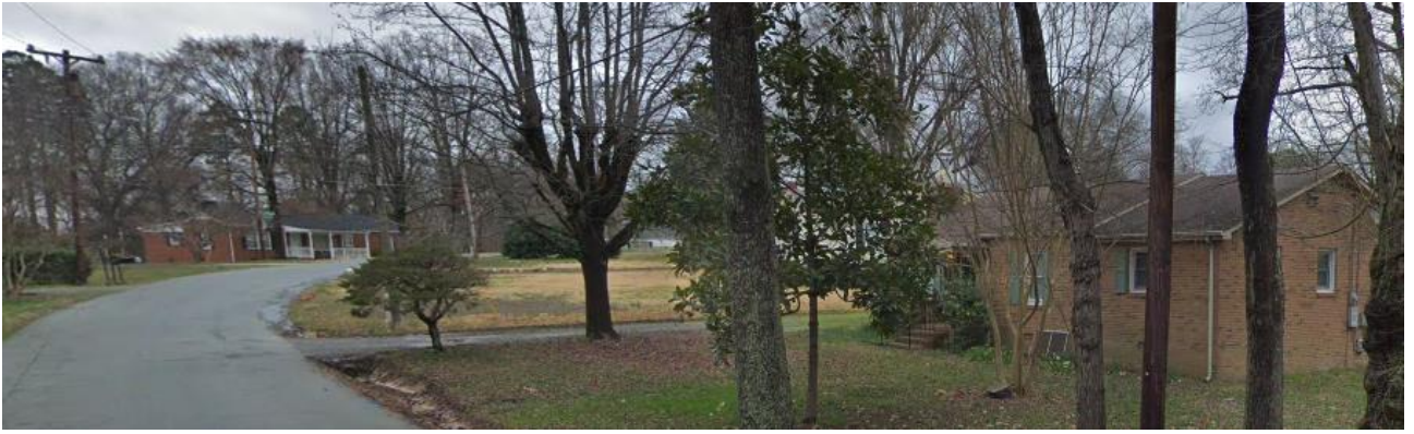
The properties to the north along Chapman Street are developed with single family homes.