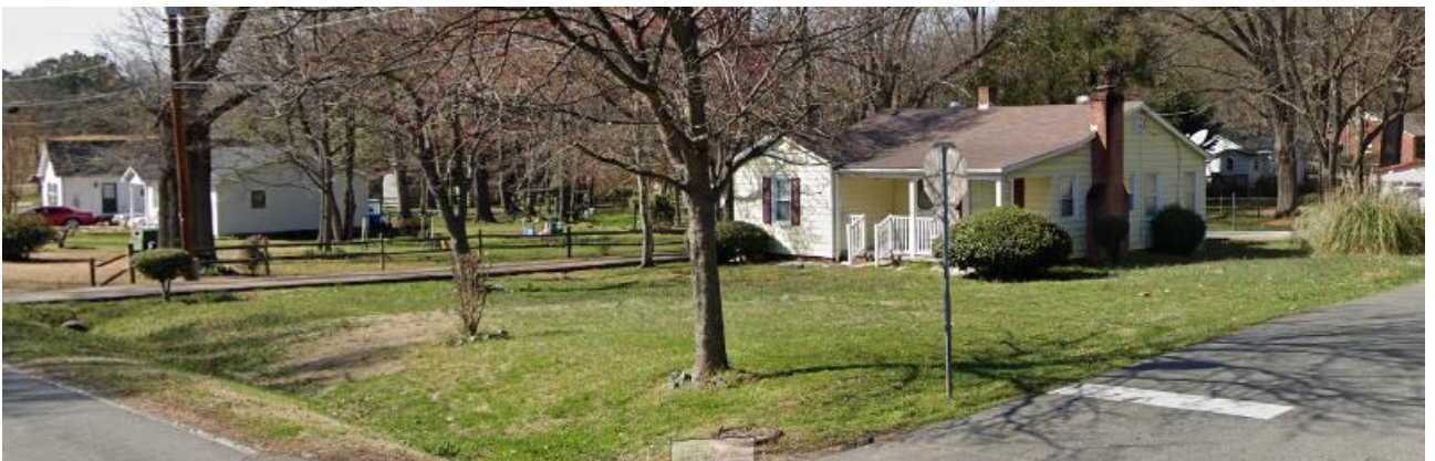
The properties to the west along Old Plank Road and Chapman Street are developed with single family homes.