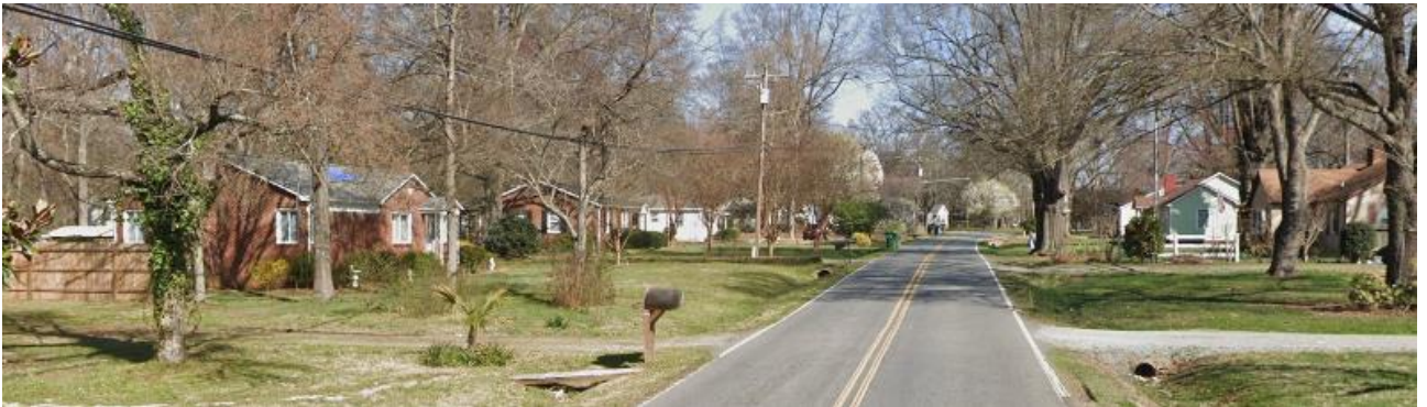
The properties to the east along Old Plank Road are developed with single family homes.