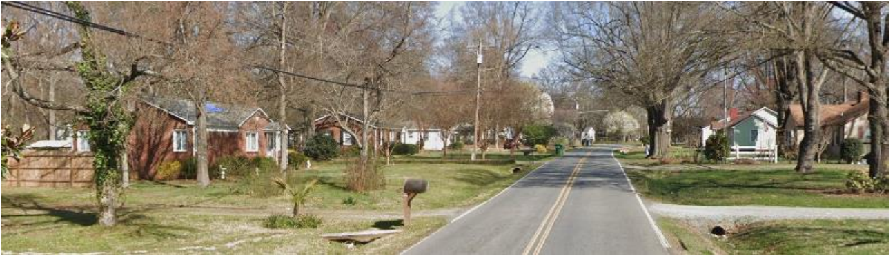
The properties to the east along Old Plank Road are developed with single family homes.