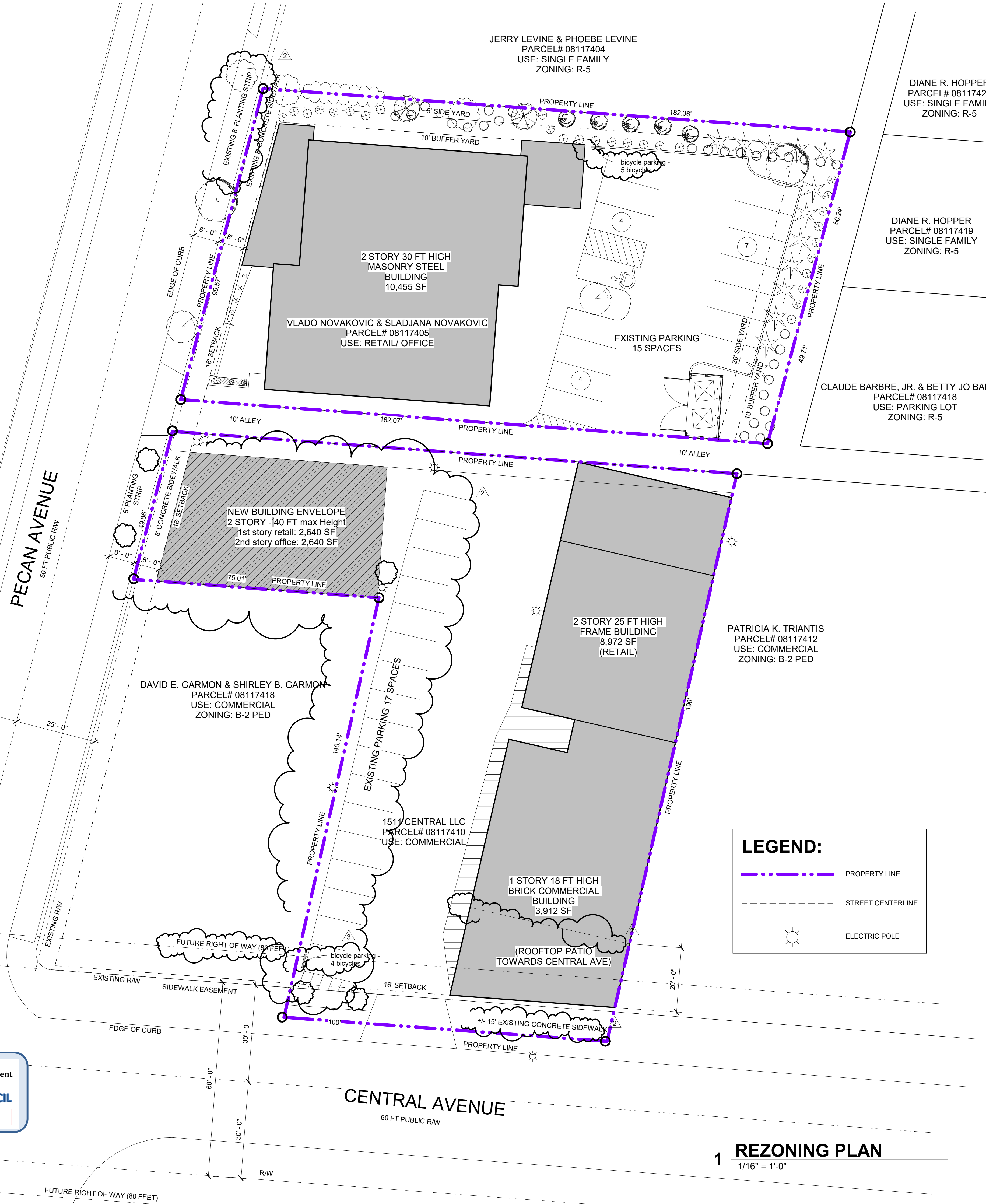
1 REZONING PLAN 1/16" = 1'-0"