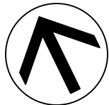
SITE PLAN Scale: 1" = 40'-0"

REZONING PETITION 2020-138-ADD DEVELOPMENT DATA • 0.472 ACRE (20,565 SF) • TAX PARCEL 08705510 • EXISTING ZONING R-4 • PROPOSED ZONING UR-2(CD) • 4 RESIDENTIAL UNITS • AS PER UR-2(CD) • FLOOR AREA RATIO PER THE ORDINANCE • BUILDING HEIGHT WILL BE PER THE ORDINANCE • 2 BUILDINGS • PARKING WILL BE PER THE ORDINANCE • OPEN SPACE WILL BE PER THE ORDINANCE • 8' WIDE PLANTING STRIP WILL BE CONSTRUCTED ON RUTGERS AVE AND LIGUSTRUM ST, PER CHAPTER 19 OF THE CITY CODE AND REQUIRED WITHIN CHAPTER 9 OF THE ZONING ORDINANCE • DEDICATION AND FEE SIMPLE CONVEYANCE OF ALL RIGHT-OF-WAYS TO THE CITY BEFORE THE CERTIFICATE OF OCCUPANCY IS ISSUED. • ALL TRANSPORTATION IMPROVEMENTS WILL BE APPROVED AND CONSTRUCTED BEFORE THE FIRST BUILDING CERTIFICATE OF OCCUPANCY IS ISSUED. • SITE WILL COMPLY WITH THE CITY OF CHARLOTTE TREE ORDINANCE • 8' PLANTING STRIP ON LIGUSTRUM STREET AND RUTGERS AVENUE PURPOSE THE PURPOSE OF THIS REZONING APPLICATION IS TO ADD PERMITTED USES - TO ALLOW AN ADDITIONAL DUPLEX ON LOT FOR A TOTAL OF 4 UNITS SURVEY INFORMATION PROVIDED BY: J. ERIC CLEMMER, P.L.S.