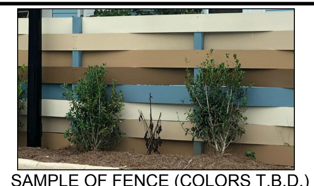
2 PRIVACY FENCE 1/2" = 1'-0"