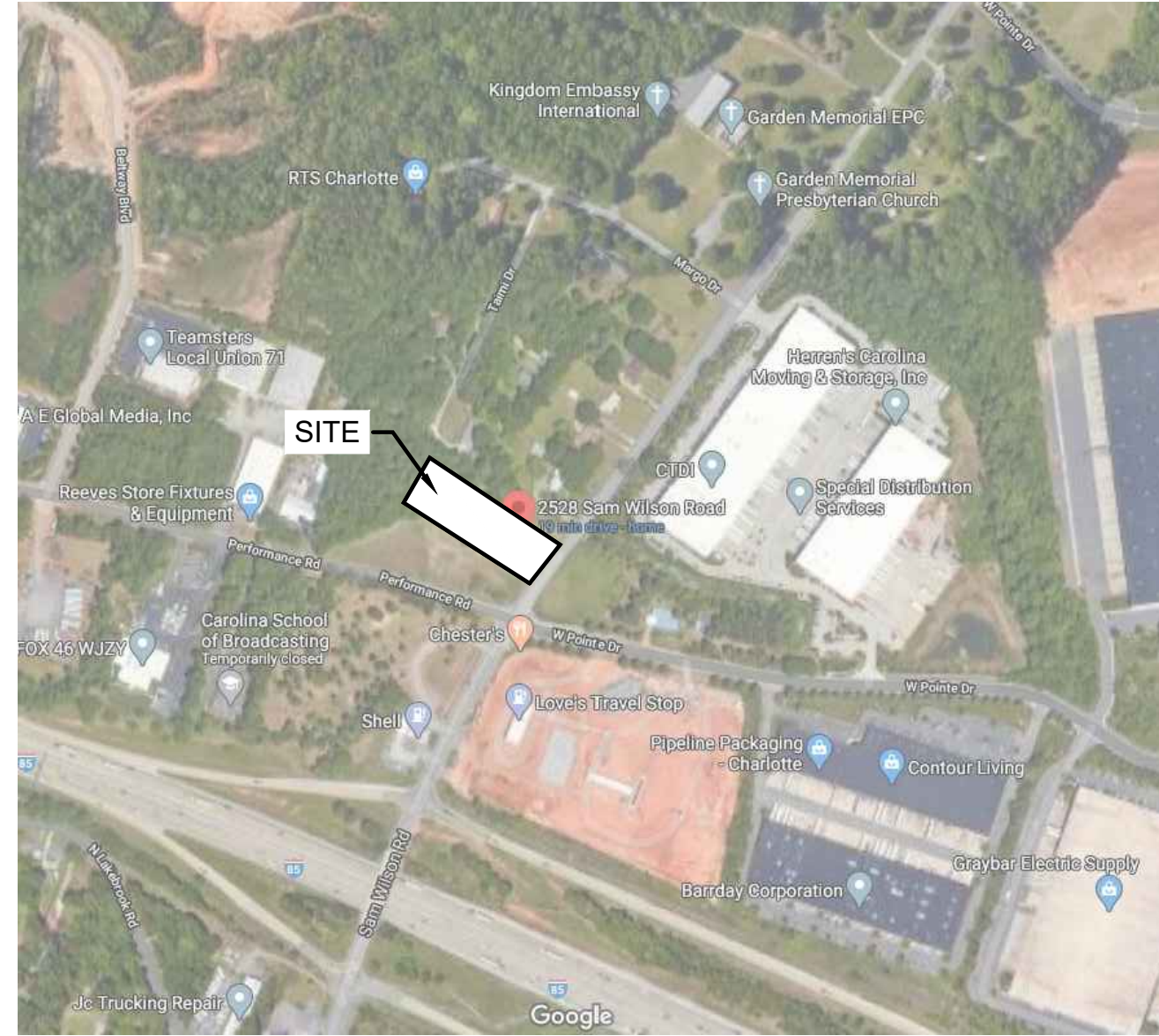
03 SITE DATA scale: NTS

Development Summary Owner: ARYANAN DEVELOPERS LLC Address: 1036 SEMINOLE DR Tax Parcel ID#: 053-142-21, 053-142-02 Total Site Acreage: 3.08 Acres Existing Zoning: R-17MF Proposed Zoning: B-2 (CD), Lake Wylie PA Parking: As allowed per zoning ordinance Max. Building Height: 65' (increased side yard if over 40')