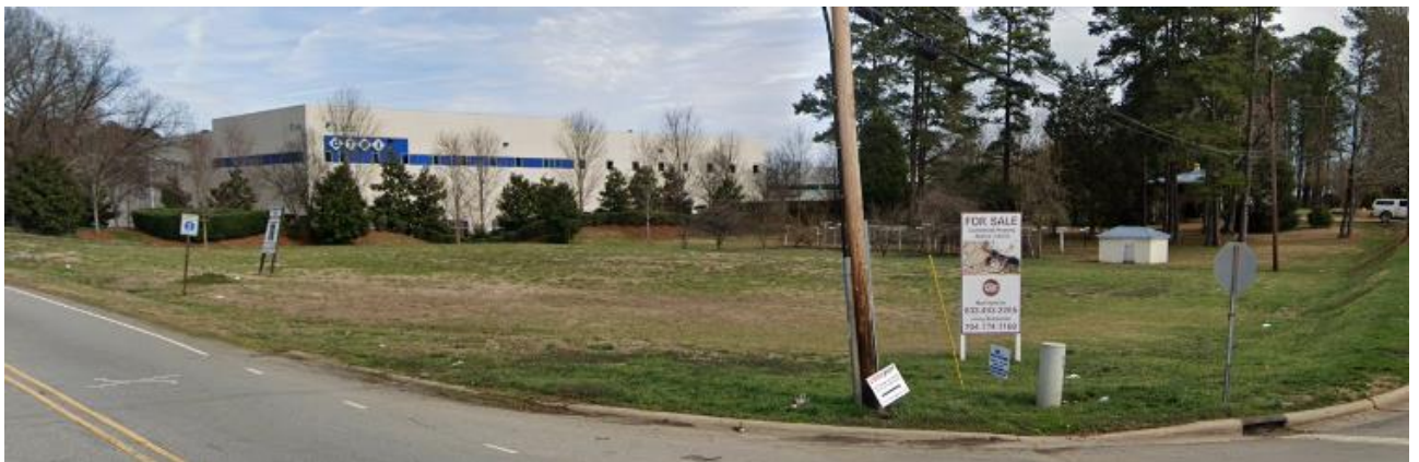
The properties to the east of the site are developed with industrial and single family residential uses.