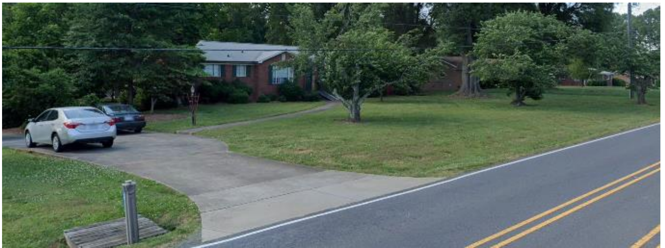
The properties to the north of the site are developed with single family homes.