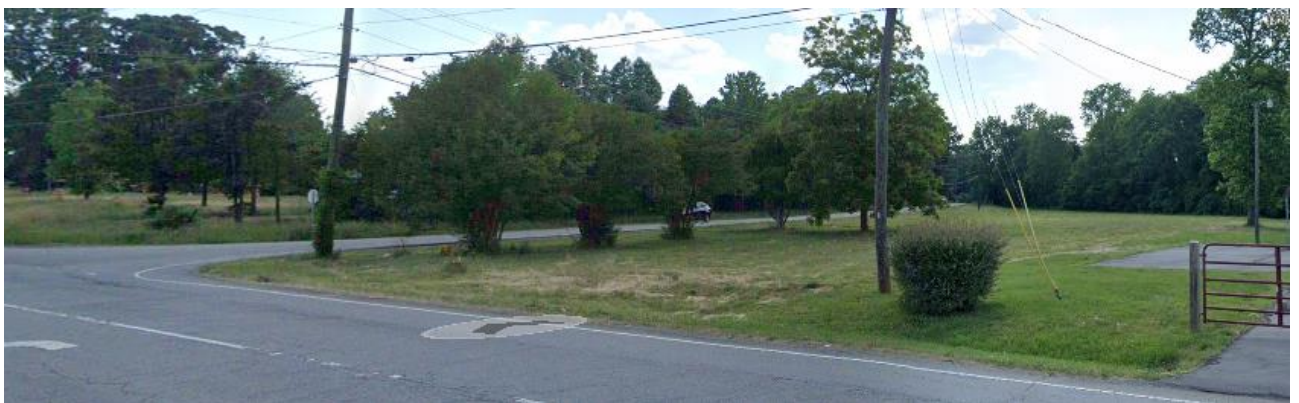
The property to the south of the site is vacant land.