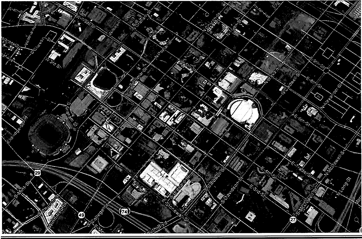
Extraordinary Event Map for Center City Charlotte December 31, 2016.

Geographic Area: The boundaries of the extraordinary event are the outside right of way or property lines of Graham Street, 6th Street, Davidson Street, and Stonewall Street.