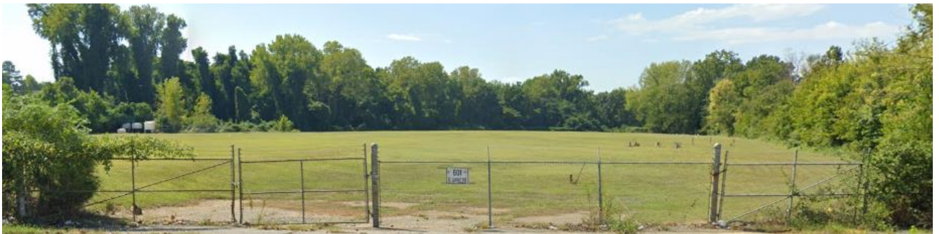
Street view of vacant property to the south of the site as seen from W Summit Avenue.