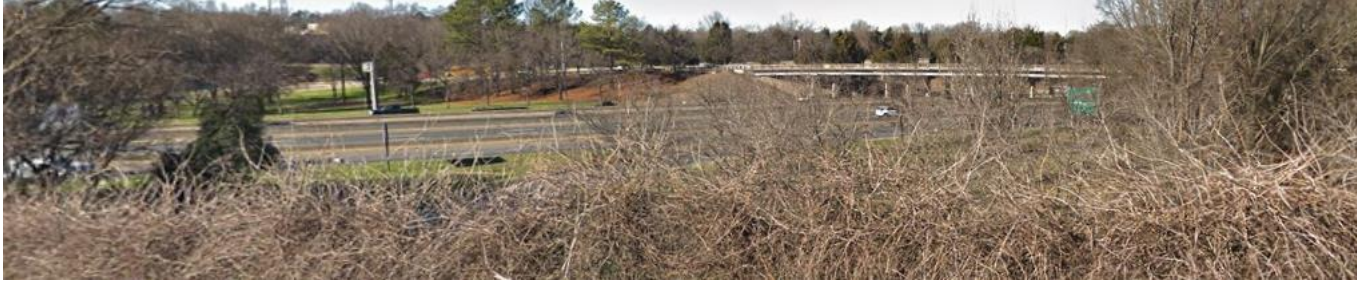
Street view of the I-77 & I-277 interchange north of the site as seen from S Clarkson Street.