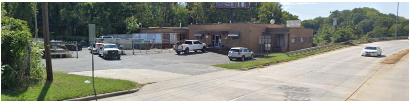
Street view of industrial use to the west of the site along S Clarkson Street.