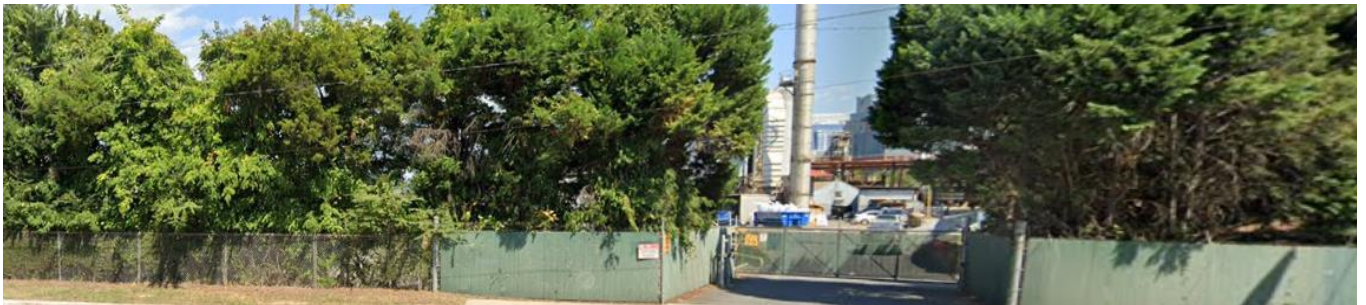
Street view of the former Charlotte Pipe & Foundry campus to the east of the site across W Summit Avenue.