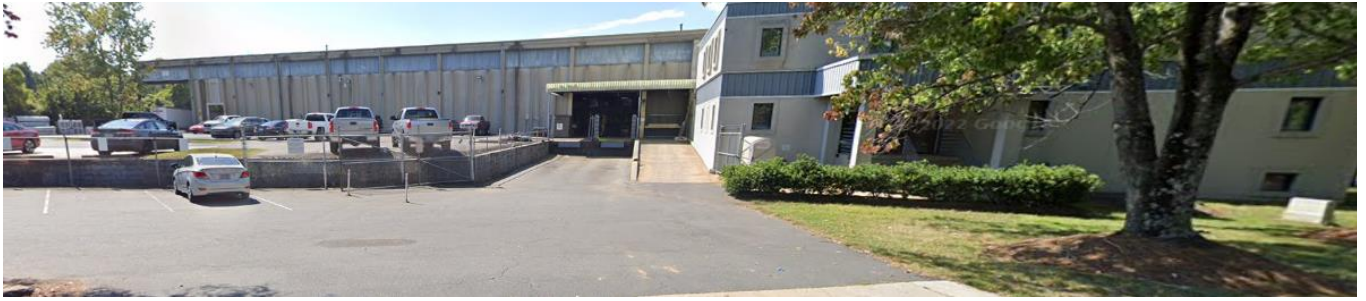
Street view of the site as seen from W Summit Avenue. The site is developed with warehouse-style buildings.