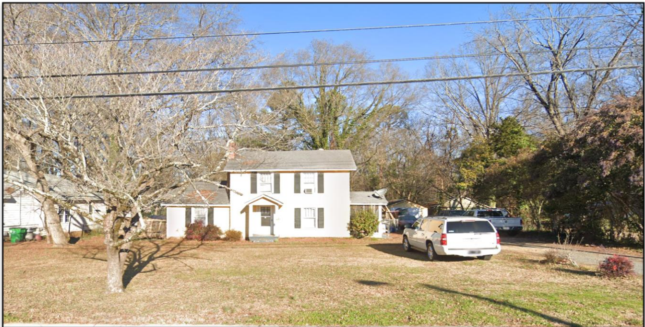
Subject site at 4019 Sofley.

The sites are surrounded by single family homes to the east and west. There is a vacant lot to the north and a church to the south.