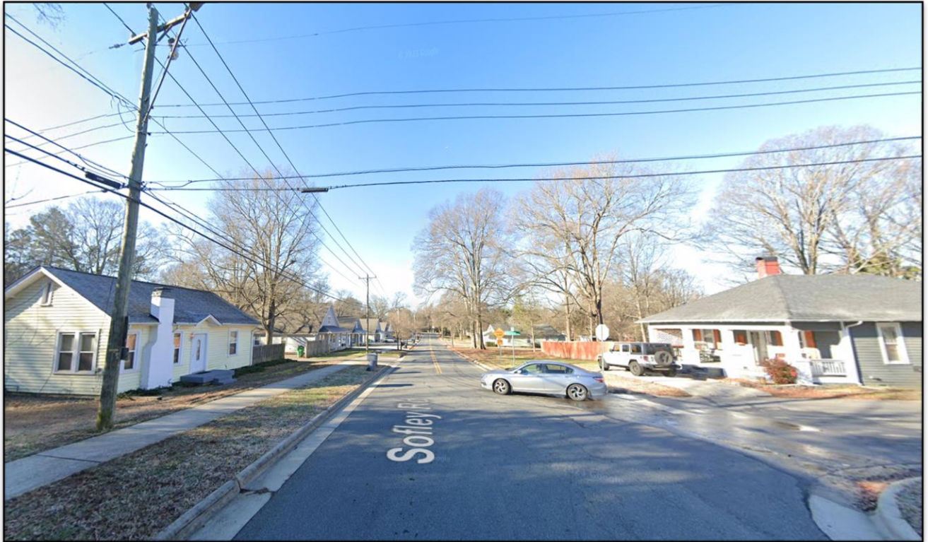
East of the site(s) are single family homes.