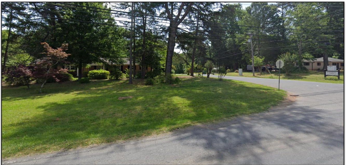
South of the site on Douglas Drive are single-family detached residential homes.