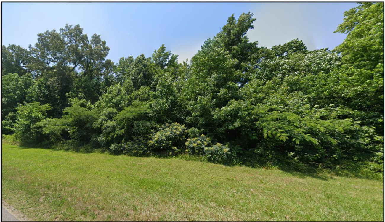
West of the site is vacant wooded land.