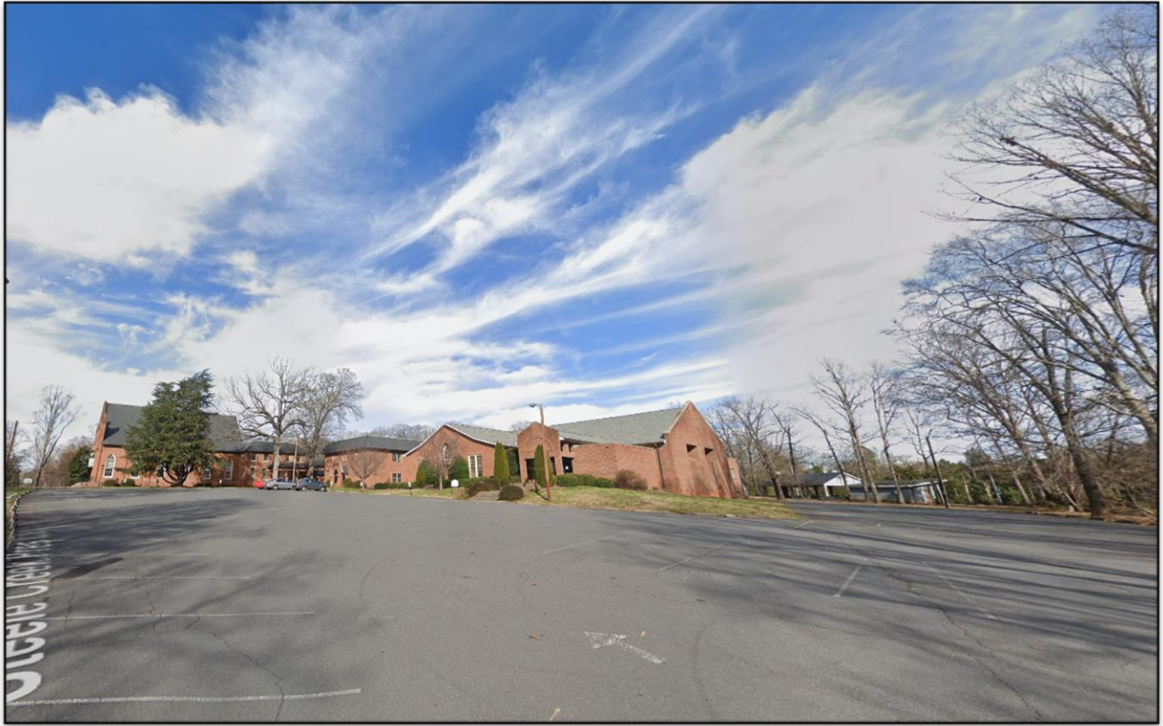
South of the site on Steele Creek Road is Steele Creek Presbyterian Church at Pleasant Hill and single-family detached residential homes.