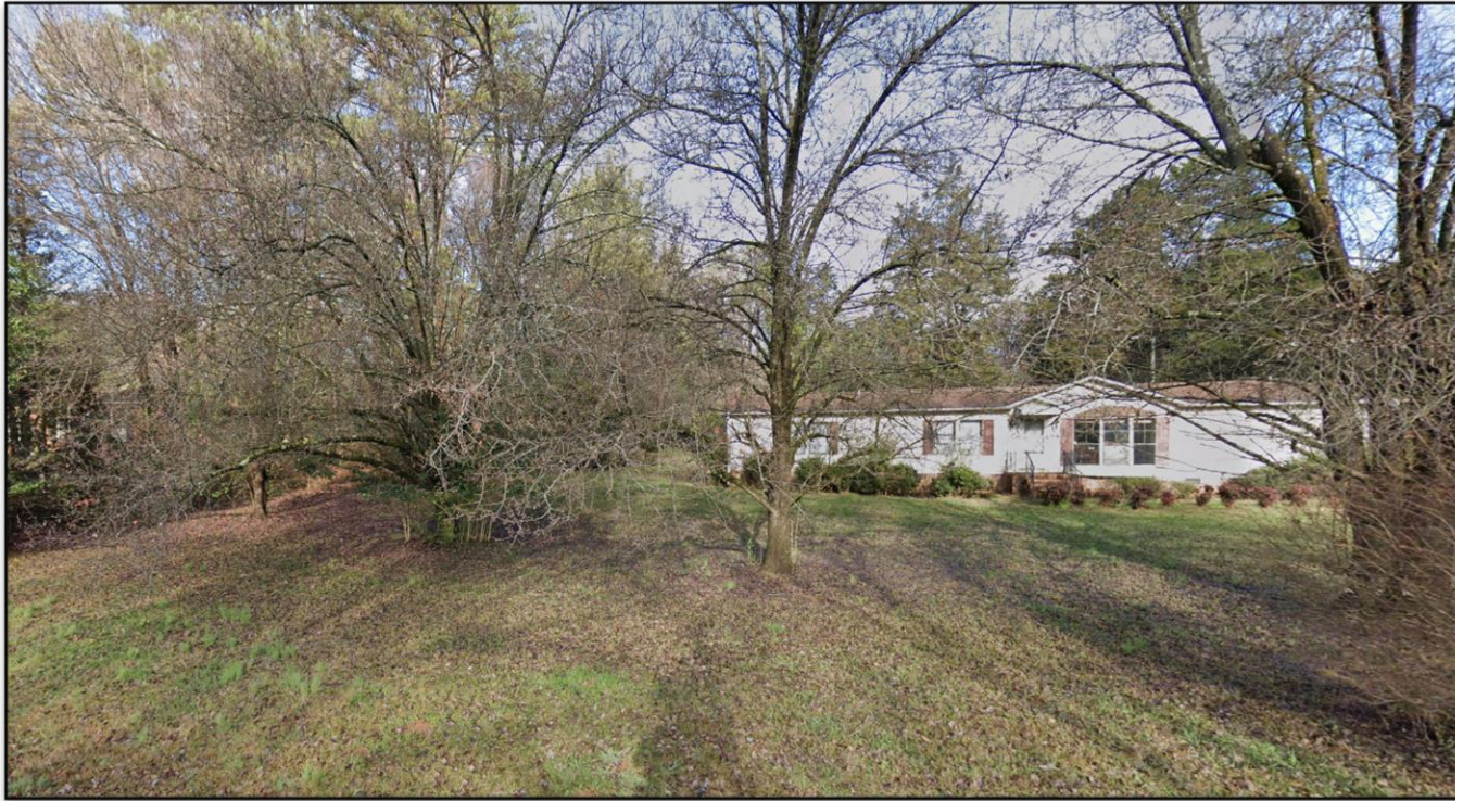
North of the site along Dorcas Lane is a single-family detached residential area.