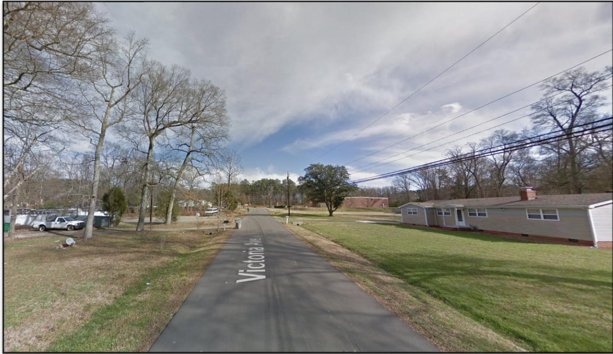
East of the site are manufactured homes.