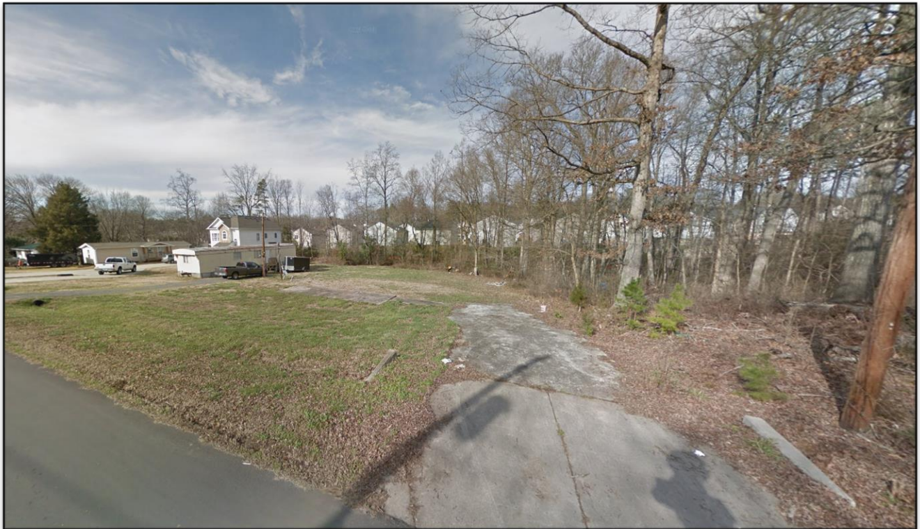
The subject site consists of two parcels; the westernmost parcel is improved with a manufactured home and the eastern parcel is undeveloped. The parcel to the west of the subject site is improved with a single-family home.