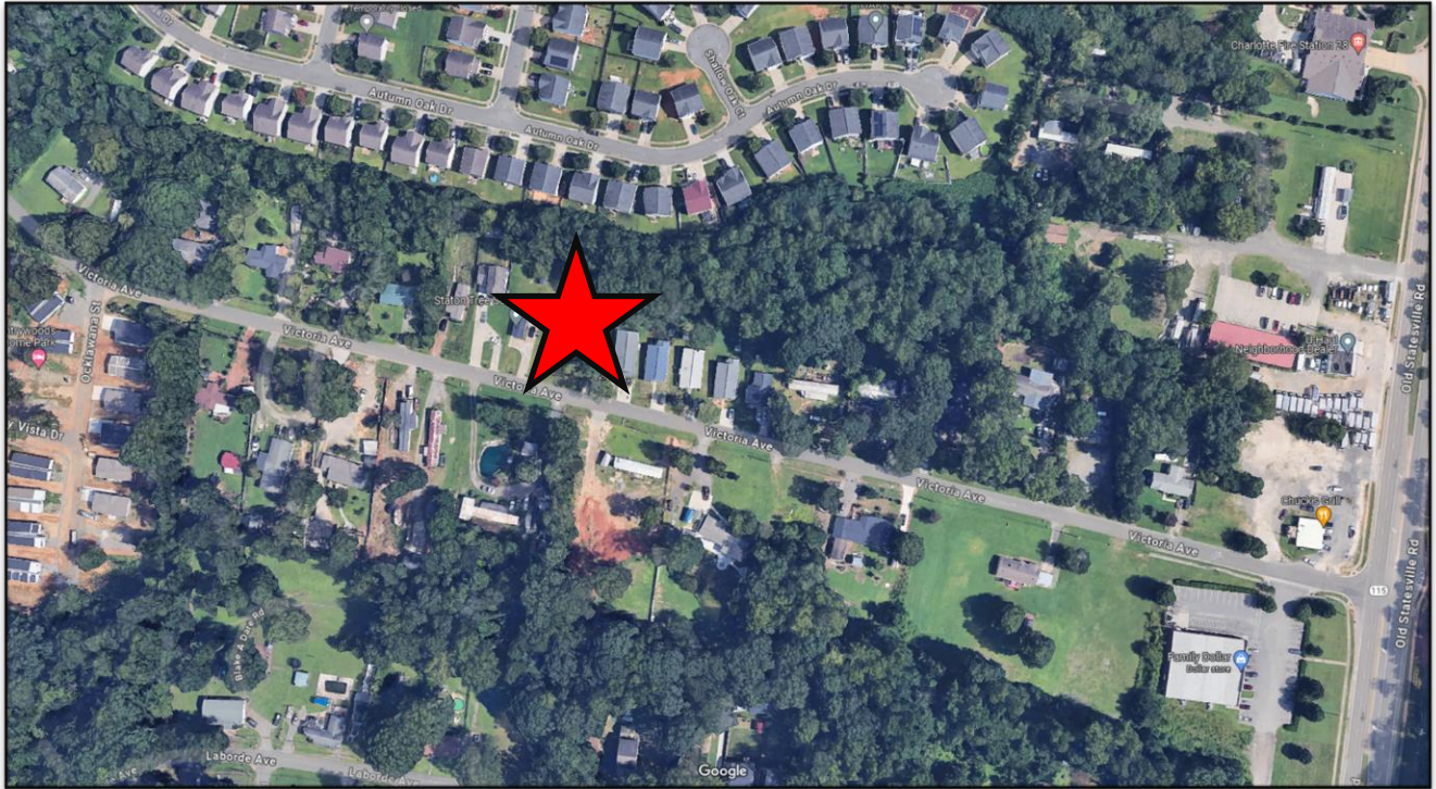
The site denoted by a red star is surrounded by single-family detached homes.