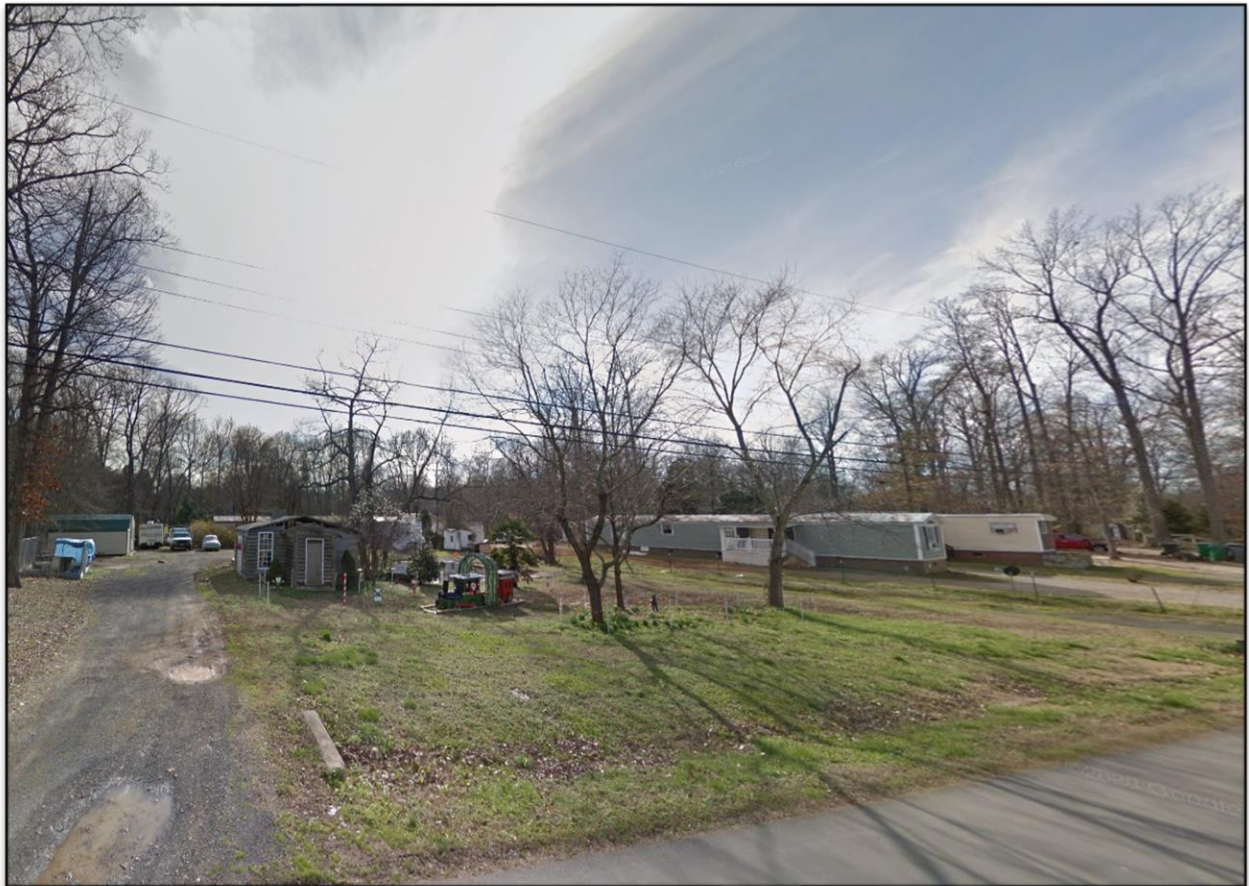
South of the site are manufactured homes.