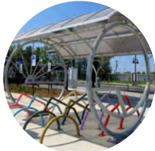
Bicycle rack at Old Concord Road Park and Ride

Short = short term bike racks | Long = long term bike racks