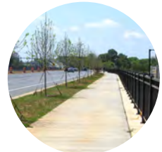
Sidewalk between JW Clay Blvd and JM Keynes Dr