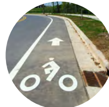
Five-foot wide bicycle lane