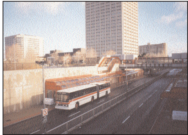
Development around a BRT station, Ottawa, ON, Canada