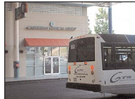
Transportation Center, Charlotte, NC