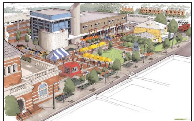
Rendering - Mixed-Use Development Huntersville, NC