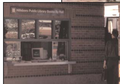
Books By Rail window, Portland, OR

should be located within a transit-oriented, multi-use or mixed-use development or in a joint-use development with other public entities. Work with the Library Board to develop a concept for small, outlet library facilities at the station and test this concept at a limited number of stations.