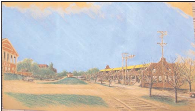
Rendering - Downtown Plan Davidson, NC