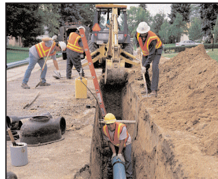
Utility crew, Charlotte, NC