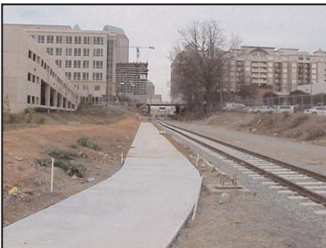
Sidewalk next to South Corridor Trolley/LRT line, Charlotte, NC