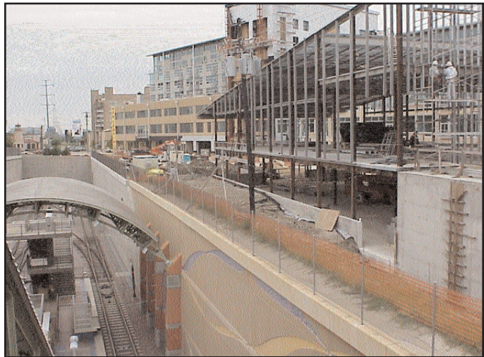
Mockingbird Station, DART, Dallas, TX

Properties should be assembled to ensure that they can be easily developed for transit supportive development.