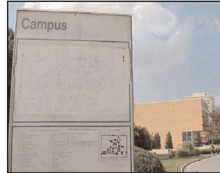
University of North Carolina at Charlotte

Also, consider joint use opportunities with schools when a library or park is proposed near a transit station.