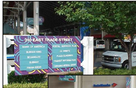
Transportation Center, Charlotte, NC