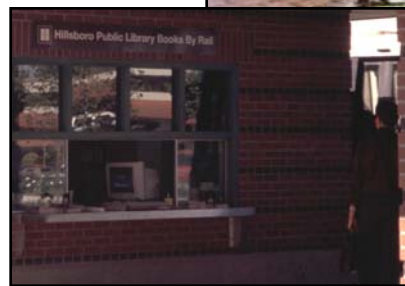
Books By Rail window, Portland, OR

B. Libraries: Locate new full service libraries with station areas when the station area is located within the proposed library's service area, as indicated on the Library Master Plan. These libraries should be located within a transit-oriented, multi-use or mixed-use development or in a joint-use development with other public entities. Work with the Library Board to develop a concept for small, outlet library facilities at the station and test this concept at a limited number of stations.