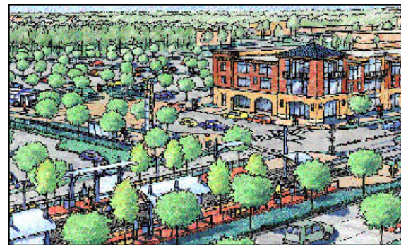
Scaleybank Road Station rendering, South Corridor, Charlotte, NC