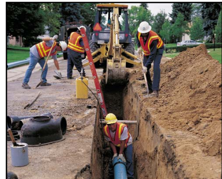
Utility crew, Charlotte, NC