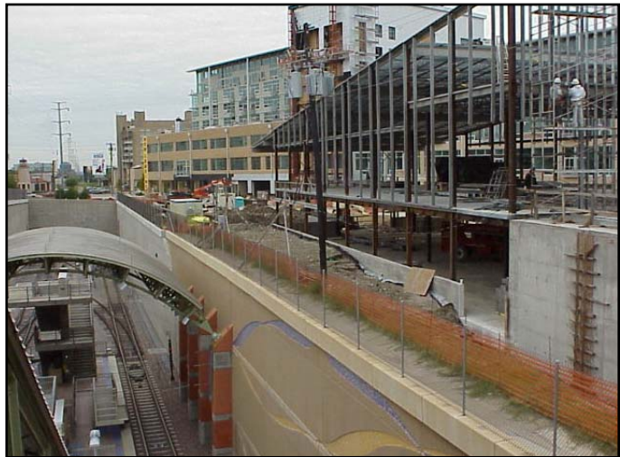
Mockingbird Station, DART, Dallas, TX

In most cases, property assemblage in station areas should be a minimum of approximately three acres in size to ensure that they can be easily developed for transit supportive development. Acquisition or assemblage of lesser acreage may be appropriate when the purchased land can be combined with land owned by other entities to create a development parcel of three acres or greater.