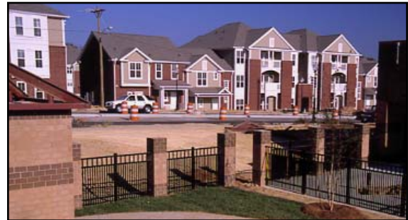
First Ward, Charlotte, NC

The City shall aggressively pursue opportunities to develop affordable housing within transit stations areas when participating in joint development projects such as building or providing loans for infrastructure, acquiring land, and/or other economic development initiatives. A transit station area is generally defined as the area within a 1/2-mile walking distance of an identified rapid transit station.