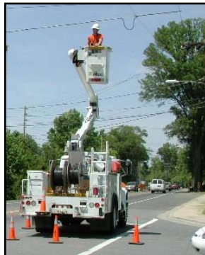
Line repair crew, Charlotte, NC