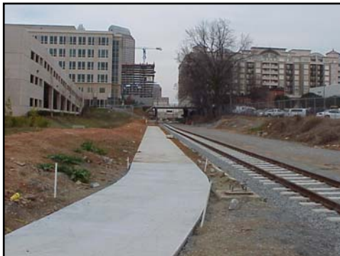
Sidewalk next to South Corridor Trolley/LRT line, Charlotte, NC