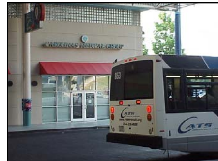
Transportation Center, Charlotte, NC