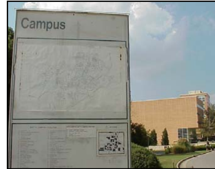
University of North Carolina at Charlotte

Also, consider joint use opportunities with schools when a library or park is proposed near a transit station.