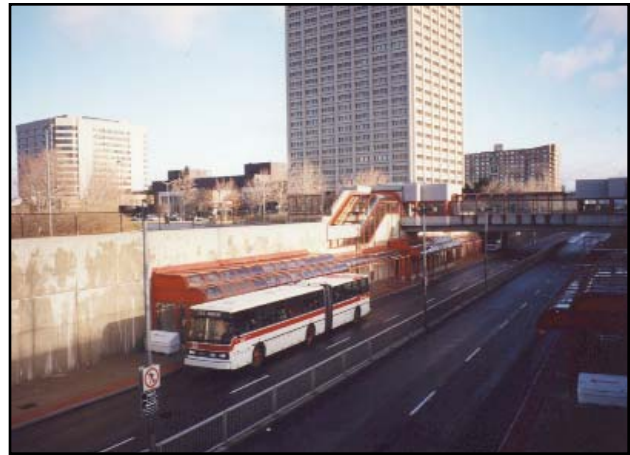
Development around a BRT station, Ottawa, ON, Canada