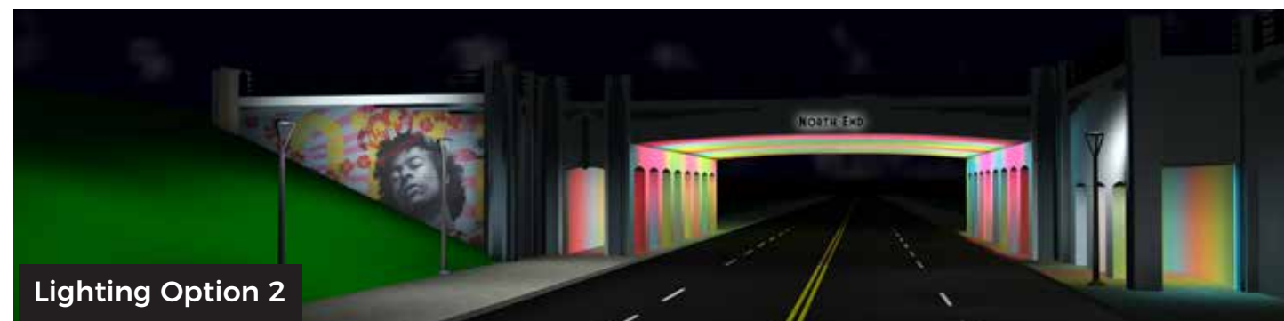
Lighting Option 2

Inspiration for mural design from: Osiris Rain (artist)