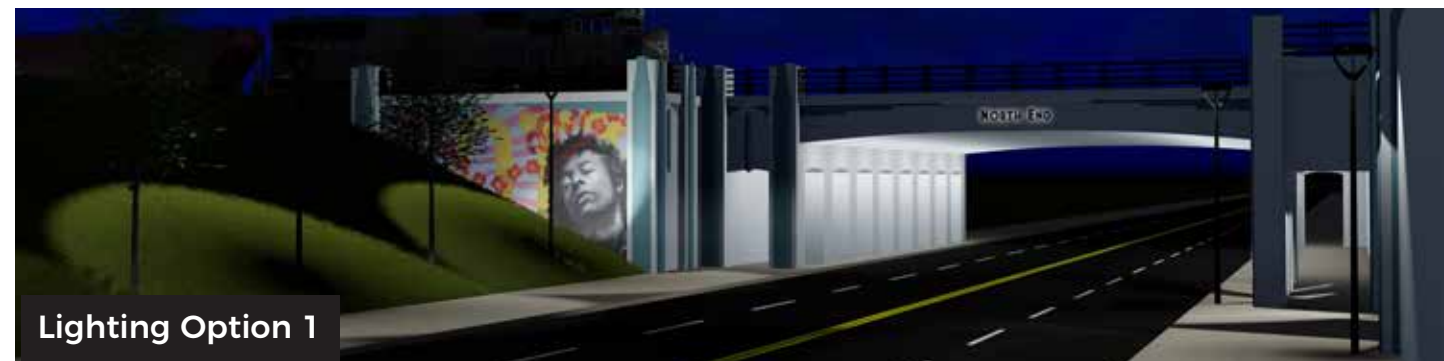
Lighting Option 1

The City has also developed two potential lighting options for the underside of both/ either of the two bridges. The options are depicted here for the bridge at 13 TH Street/ Church Street.