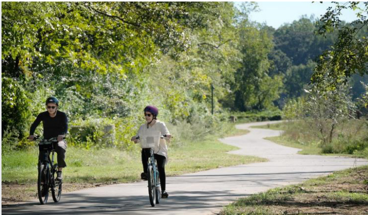
Little Sugar Creek Greenway: Completed section of the XCLT

The City of Charlotte is partnering with Mecklenburg County to create a 30+-mile trail and greenway facility that will stretch from the City of Pineville through Center City and on to the UNC Charlotte campus and Cabarrus County line. This project will complete Segment 8 of the Cross Charlotte Trail through the Hidden Valley neighborhood from North Tryon Street to Orr Road. This project provides safe and comfortable pedestrian/bicycle connections to the Hidden Valley neighborhood, Dr. Martin Luther King Jr. Middle School, Hidden Valley Neighborhood Park and the LYNX Blue Line.