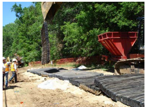
Heavy mats and several feet of dirt cover the dynamite drilled into rock.

Holes are drilled into the rock underground for dynamite placement. Packed dirt is added to holes and above the rock. A seismograph monitor records blast vibrations to verify they are within specifications.