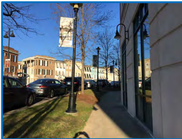
Poor Pedestrian Access to On-Street Parking