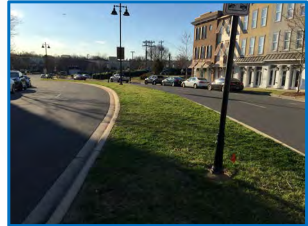
Lack of Pedestrian Access Across Ayrsley Town Blvd